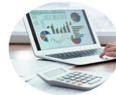
TENNCARE QUARTERLY REPORTING

FOR MORE INFORMATION: 833-787-2542 | www.ruralhealthclinic.com