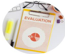
RHC PROGRAM EVALUATIONS