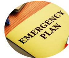
EMERGENCY PREPAREDNESS COMPLIANCE