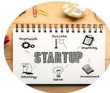
RHC STARTUPS & CONVERSIONS