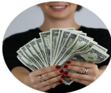
RHC COST REPORTING