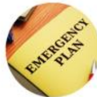
EMERGENCY PREPAREDNESS COMPLIANCE