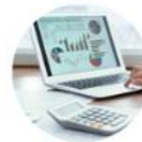
TENNCARE QUARTERLY REPORTING

FOR MORE INFORMATION: 833-787-2542 | www.ruralhealthclinic.com