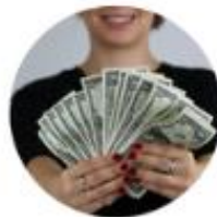
RHC COST REPORTING