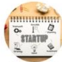
RHC STARTUPS & CONVERSIONS