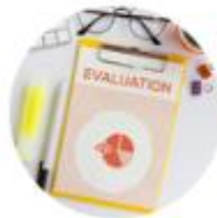
RHC PROGRAM EVALUATIONS